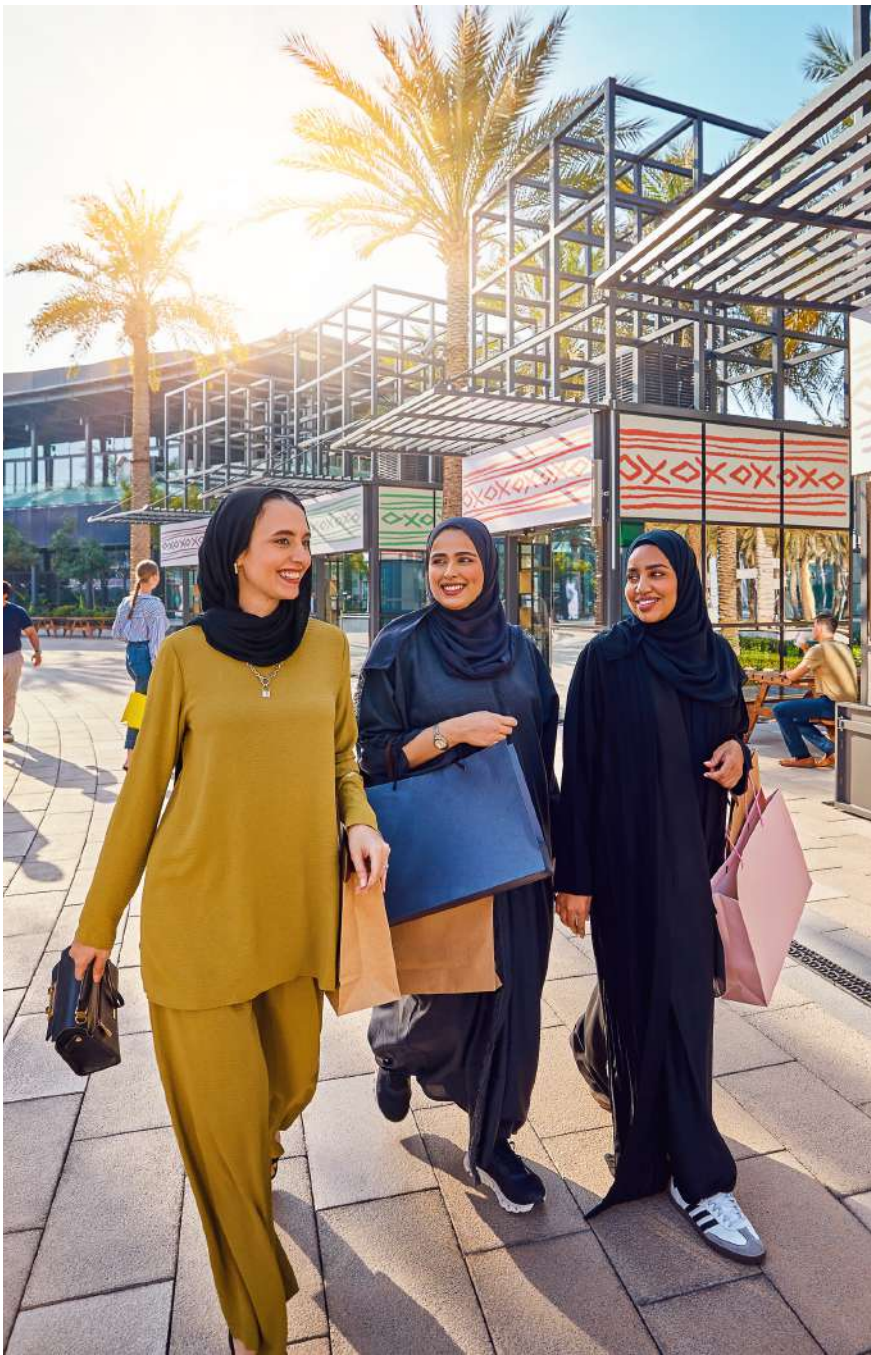
Within easy reach of the community square, offices, theatre, 5-star hotel, the Expo City market and numerous restaurants and retail outlets

سدر ريزيدنسز SIDR RESIDENCES في مدينة إكسبو دبي AT EXPO CITY DUBAI