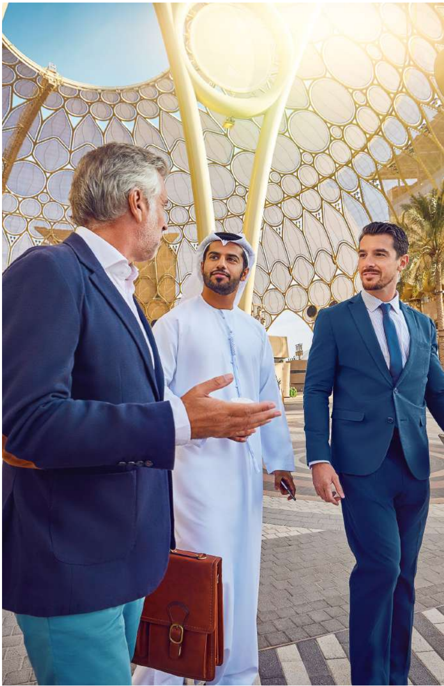
Five minutes from Al Wasl Plaza with its outdoor performances and immersive projections