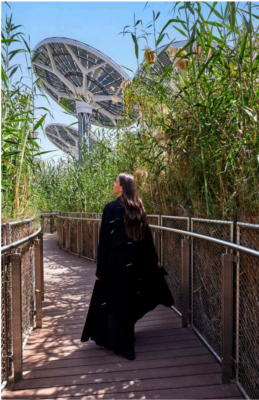
Sweeping outlooks across Al Wasl Plaza, the UAE Pavilion and Terra, with views of Surreal water feature from higher floors