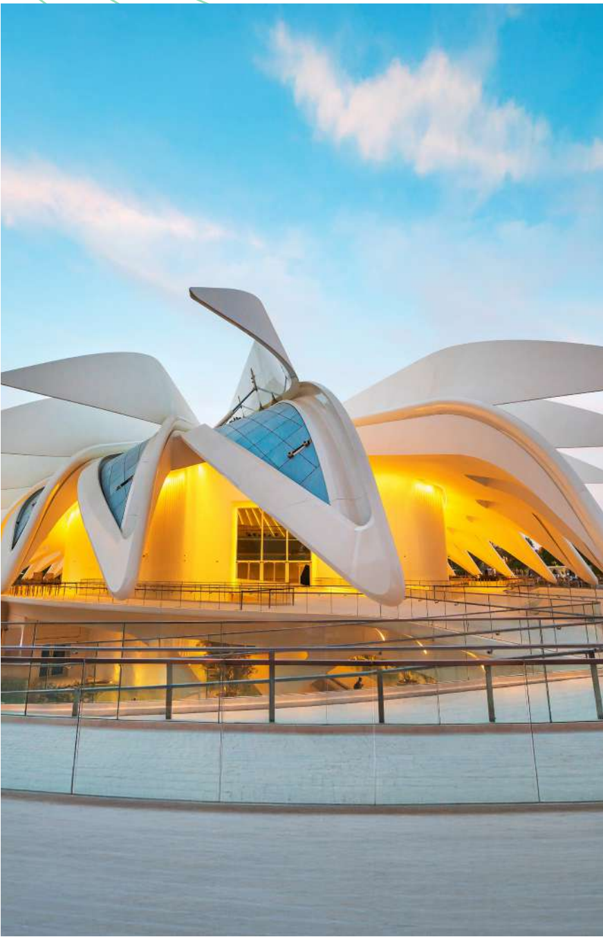
Direct access to the UAE Pavilion via the lush Ghayath Trail