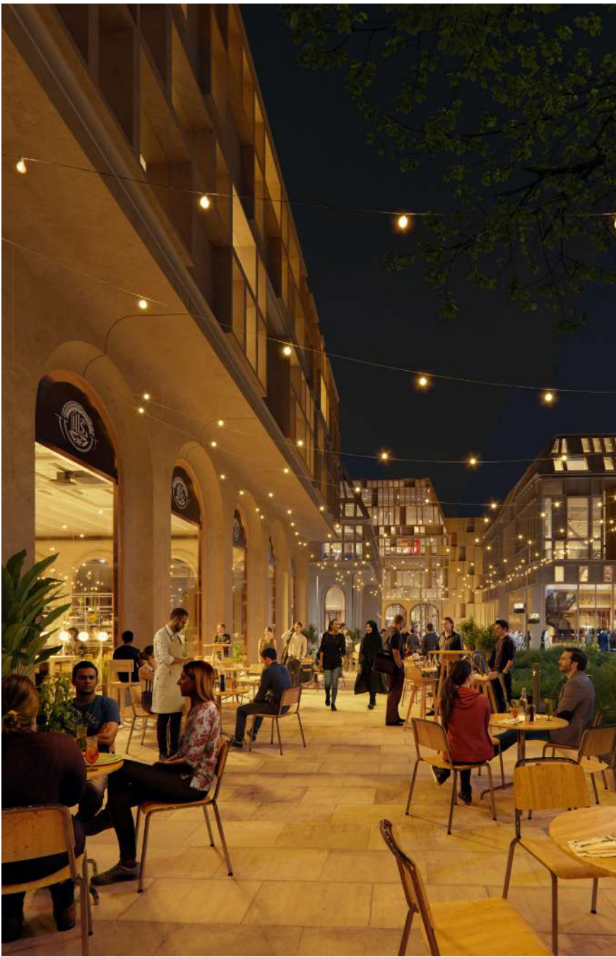
Bordering Expo Business offering prime connections to high-end professional opportunities as well as extensive dining and retail options